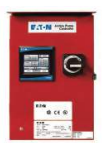
Jockey Pump Controller Panels