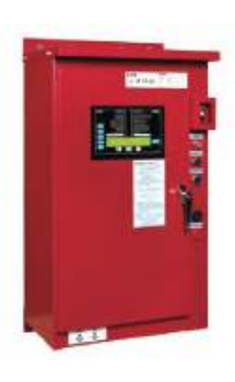
Diesel Engine Pump Controller Panels